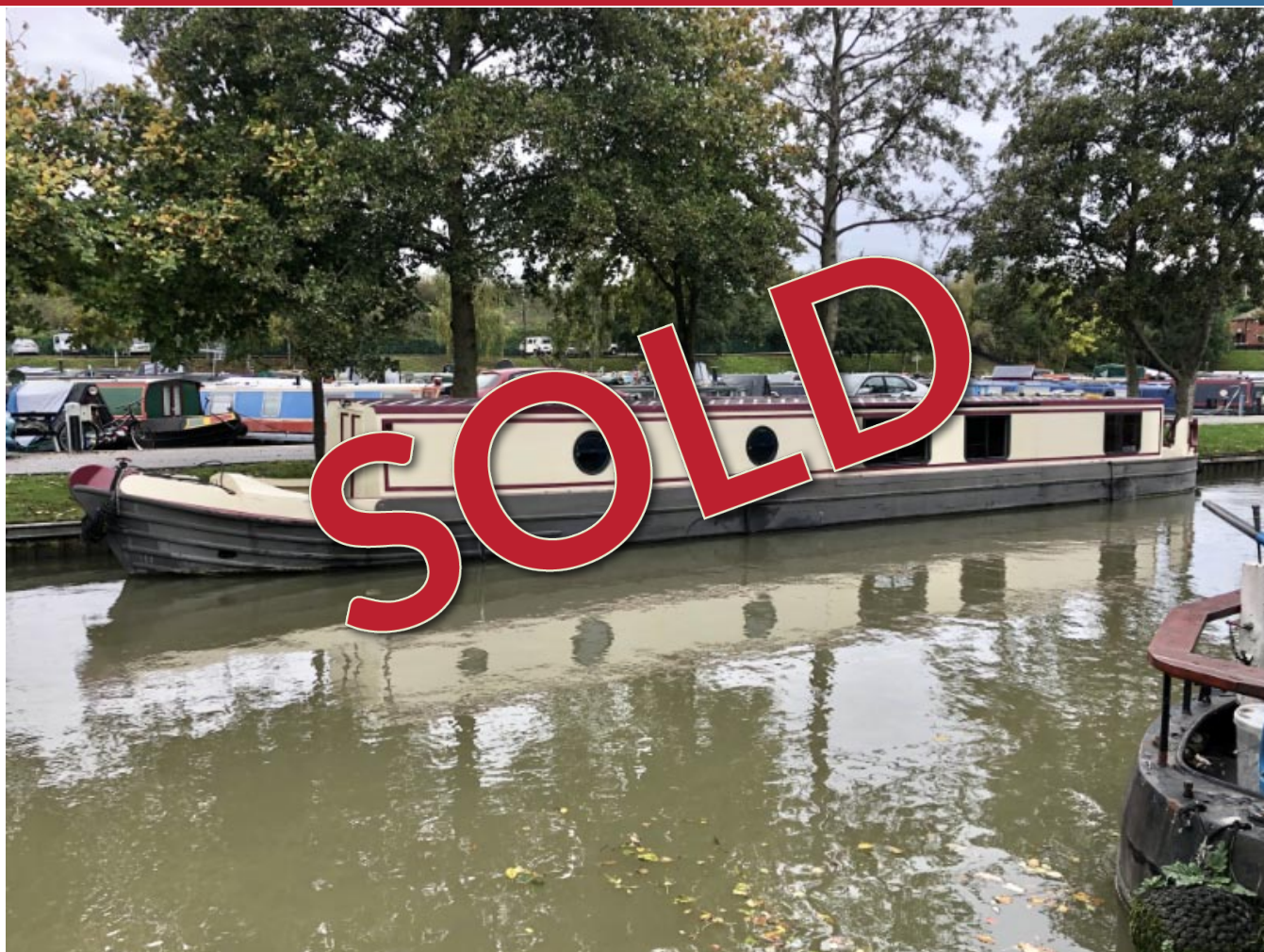
60ft, Chris Elwell, 2013, Semi-Traditional Style