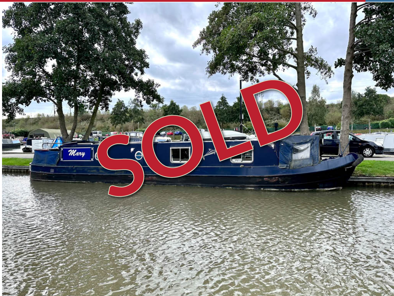
44ft, East West Marine, 2007, Cruiser Style