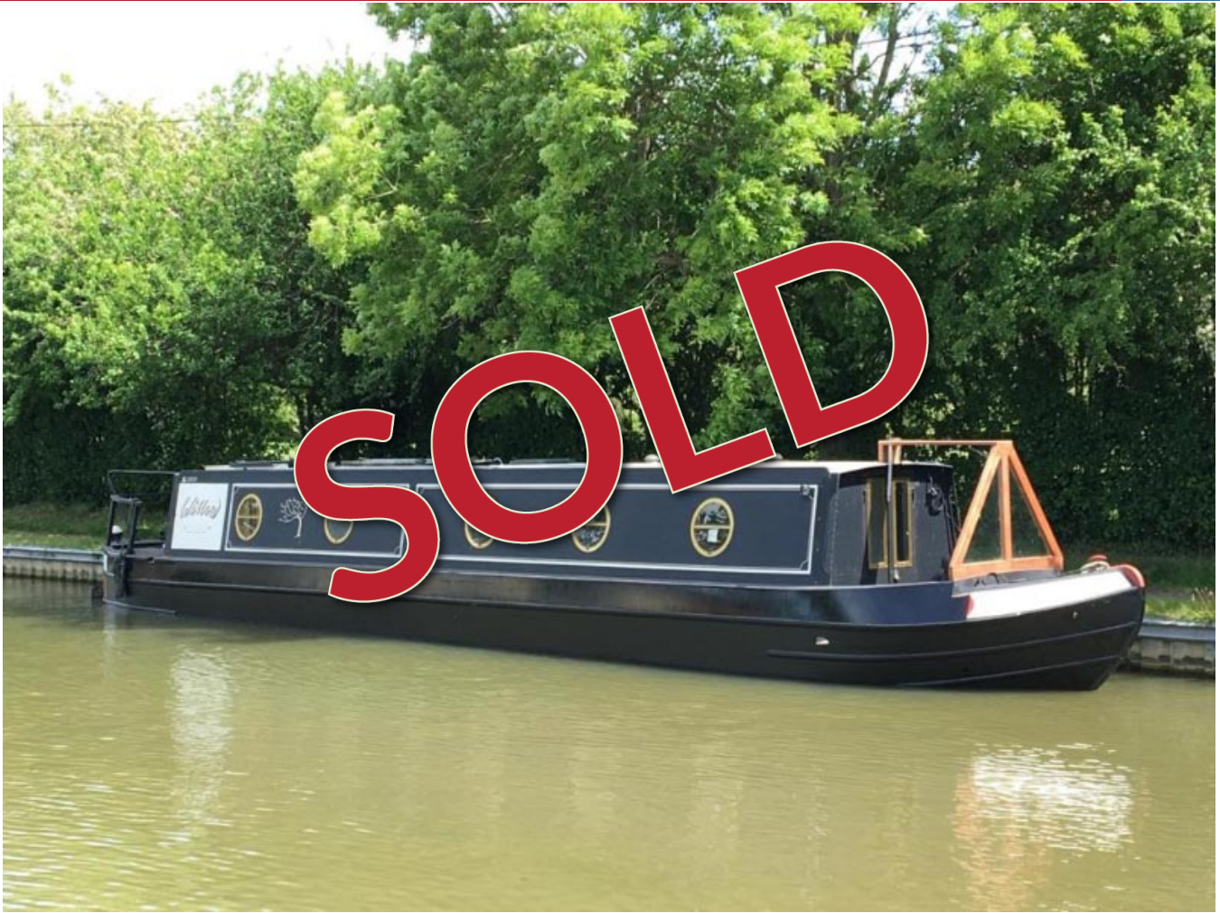
48ft, Nick Thorpe, 2005, Cruiser Style