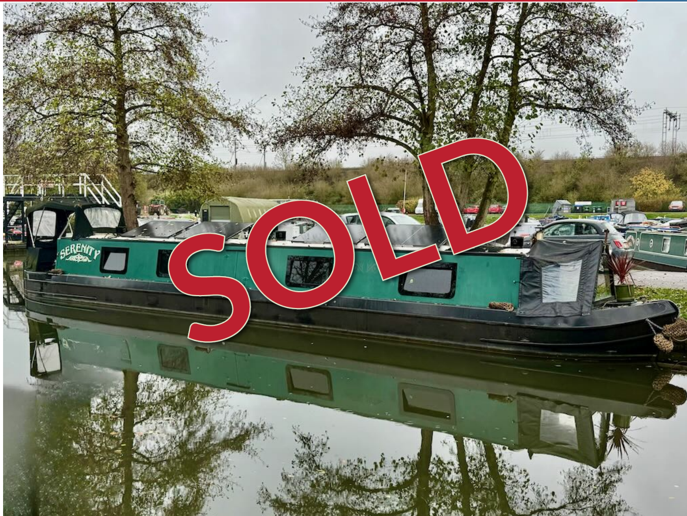
57ft, Liverpool, 2007, Cruiser Style