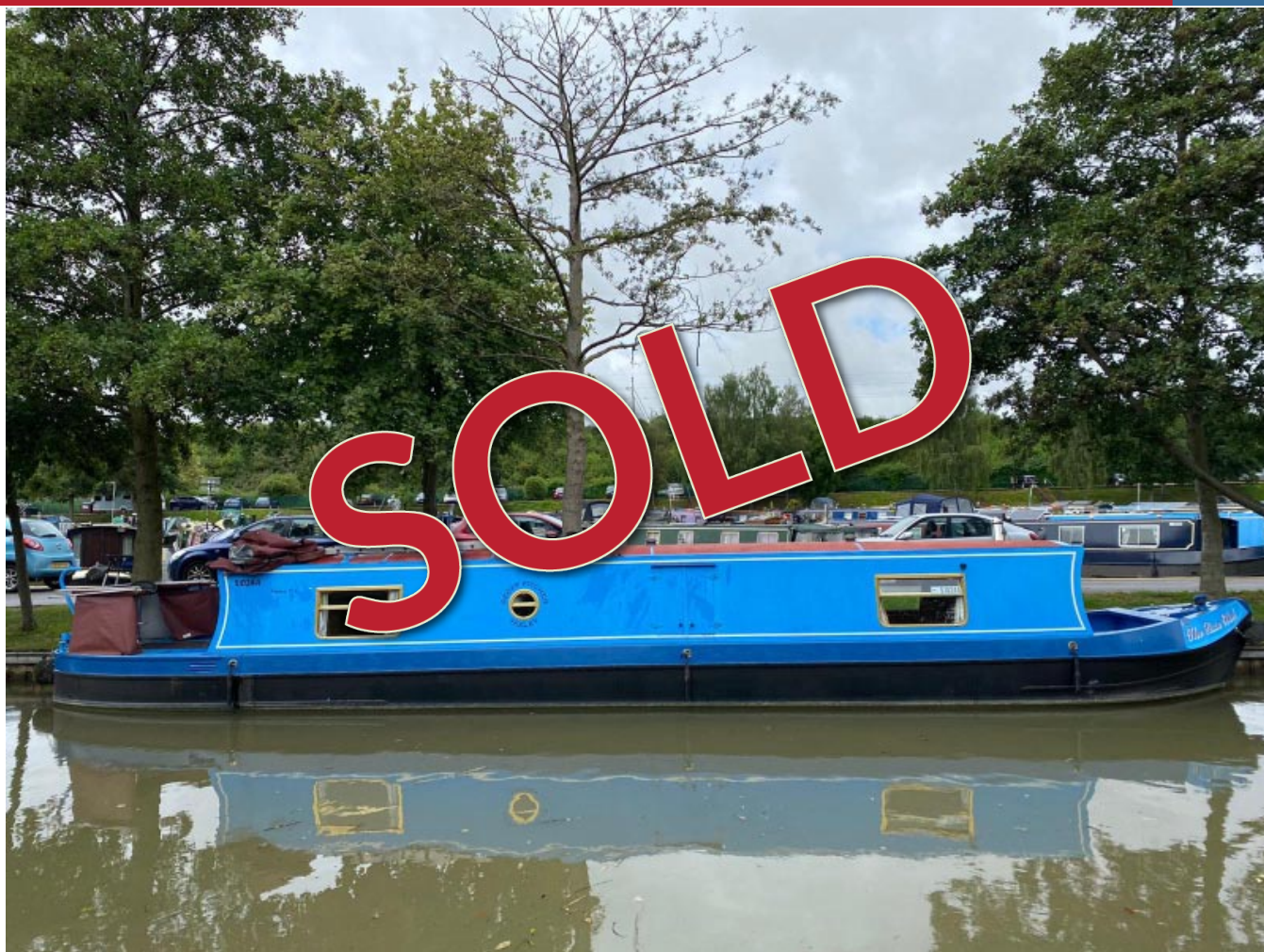
45ft, Liverpool, 2004, Cruiser Style