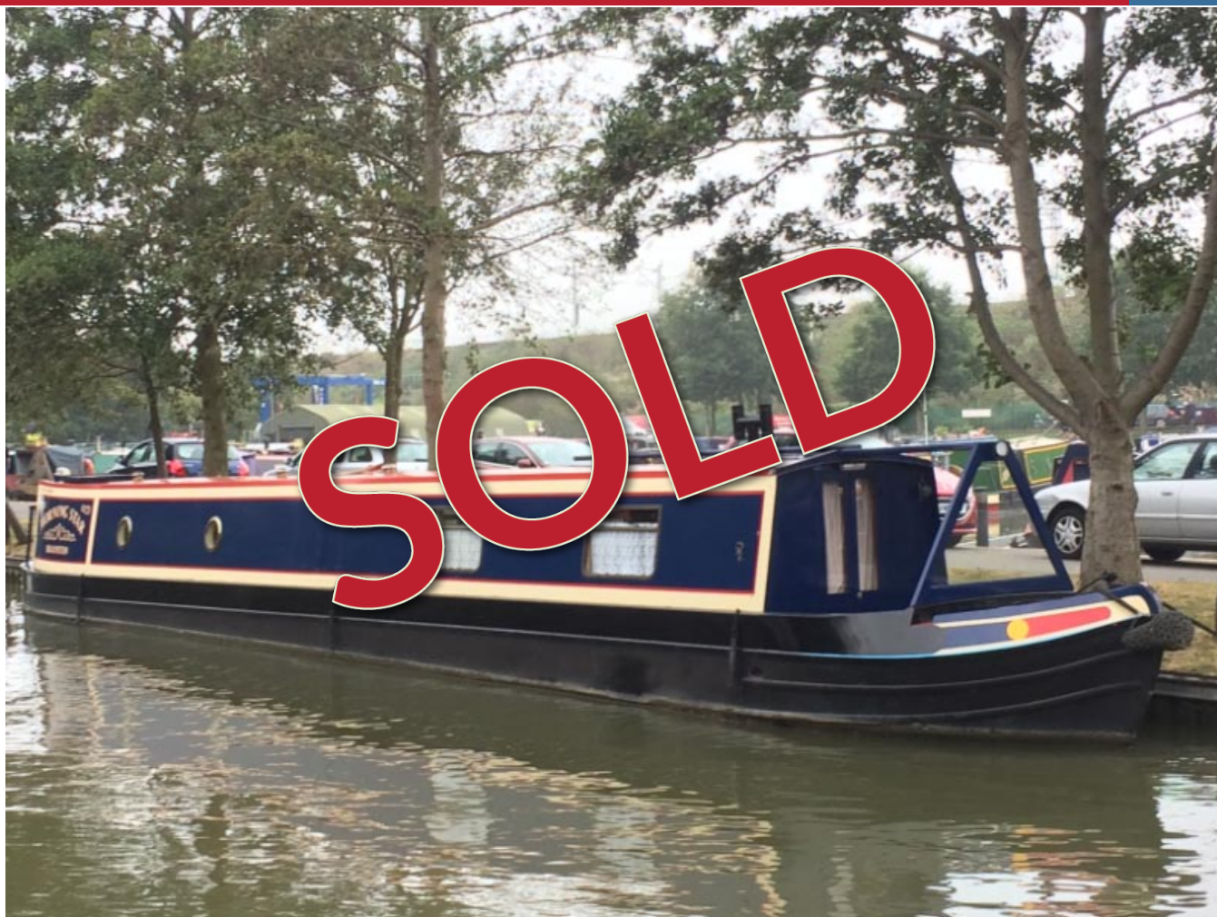
57ft, Les Wilson, 2003, Traditional Style