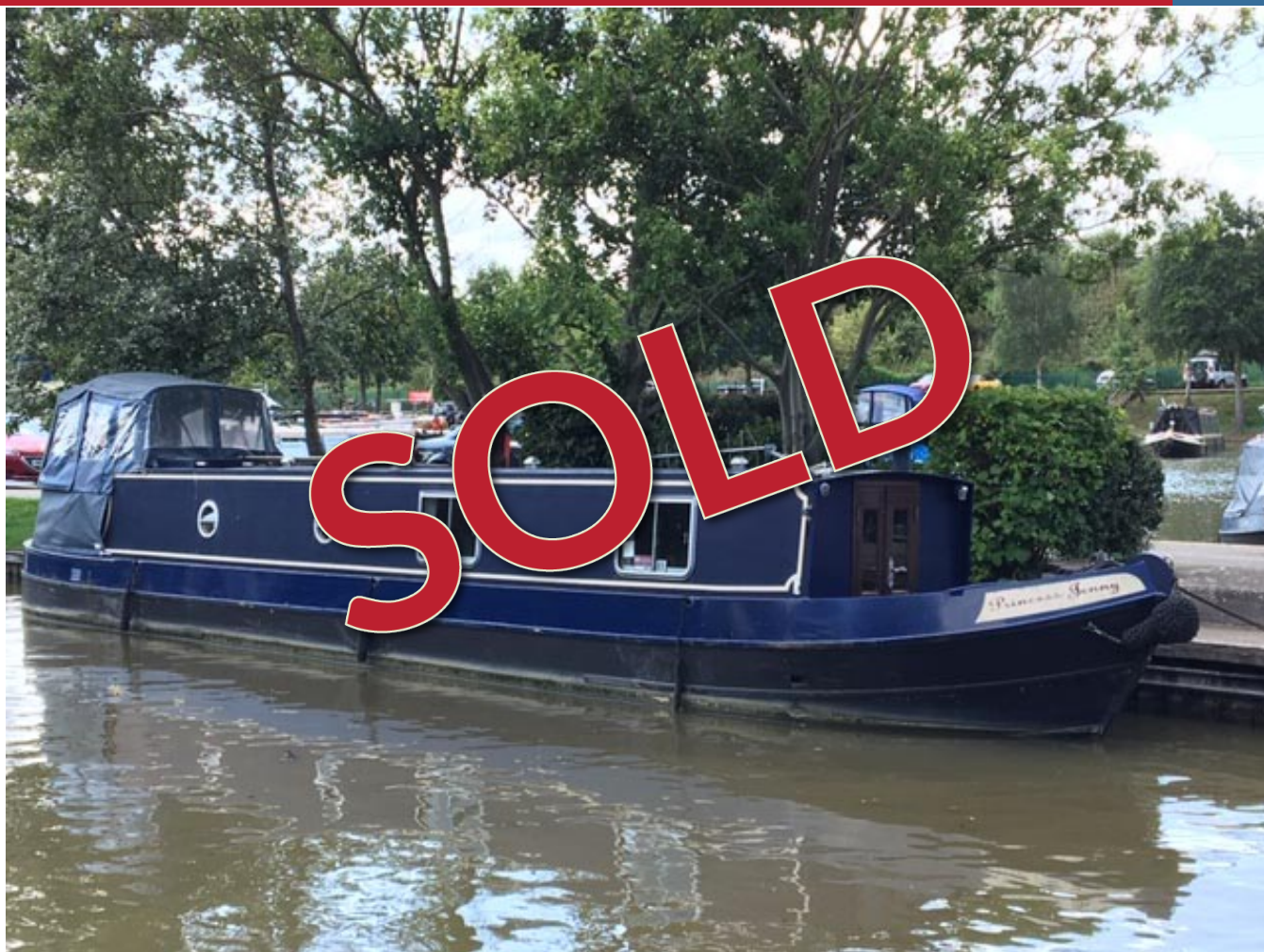
44ft, East West Marine, 2008, Cruiser Style