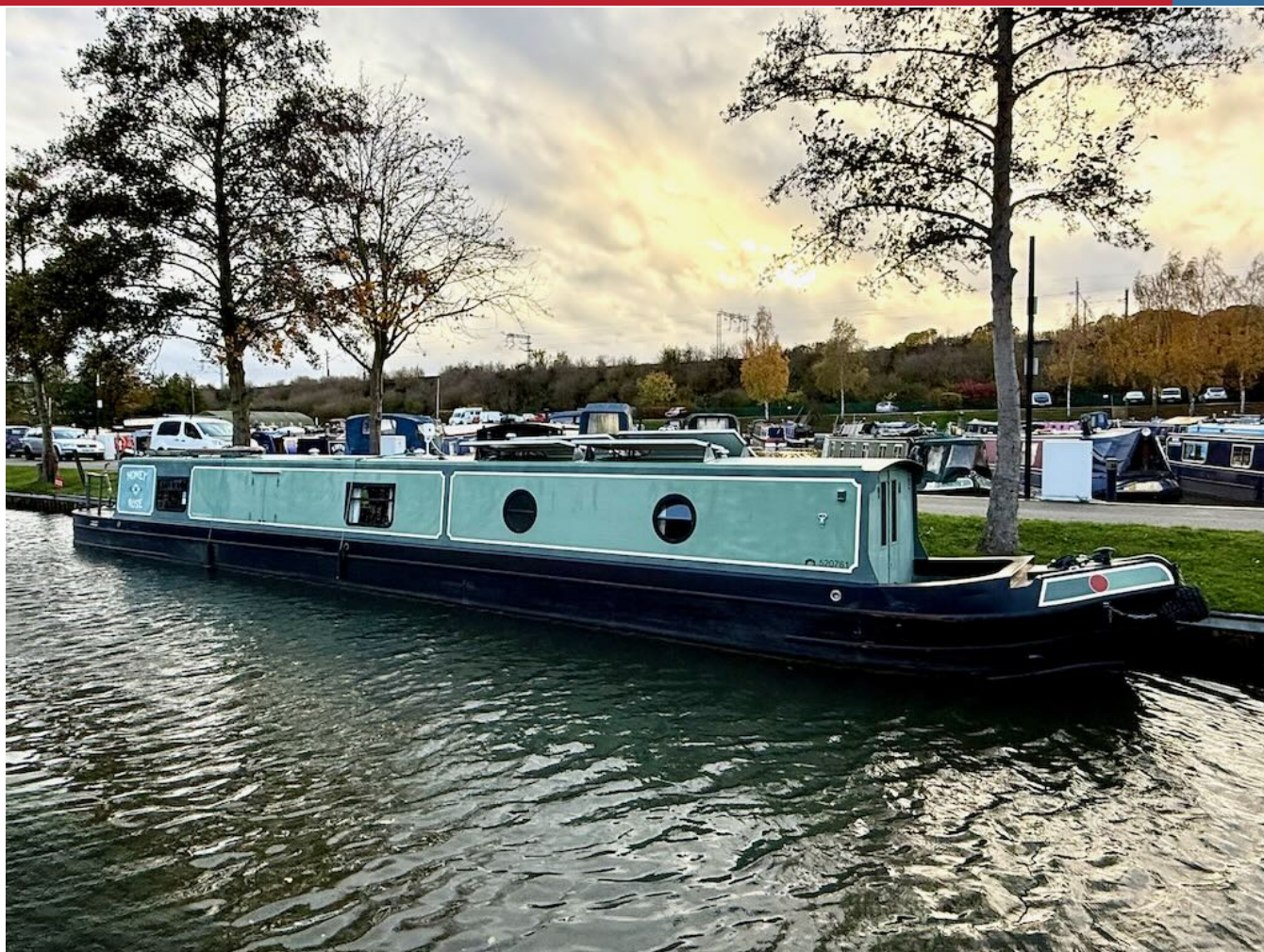
57ft, Aintree, 2013, Cruiser Style