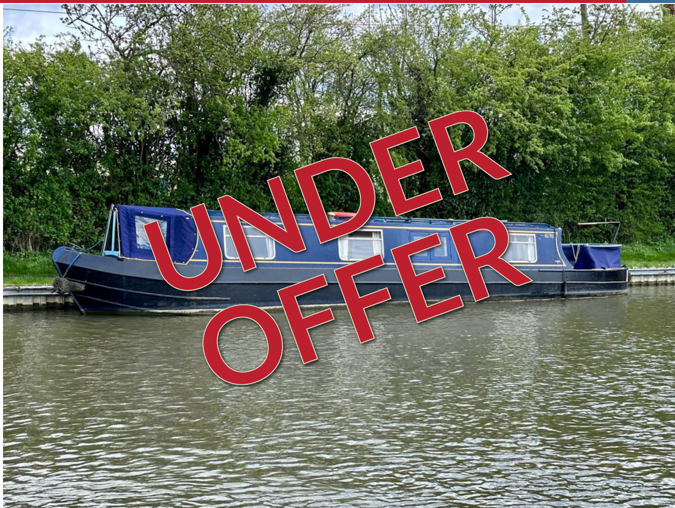
40ft, D J Clark, 1991, Cruiser Style